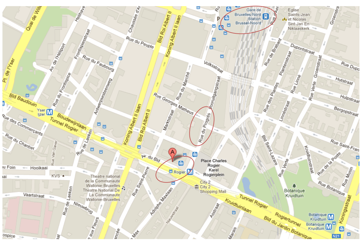
Figure 1: Location Thon Hotel Brussels City Centre