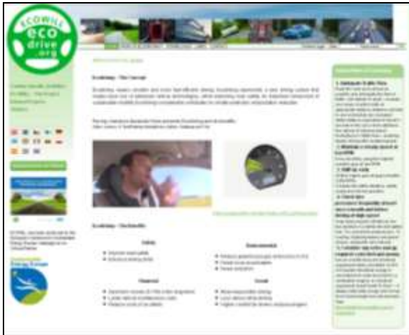
The ECOWILL website www.ecodrive.org

Various dissemination activities took place within the ECOWILL project. The project website ( www.ecodrive.org ) was continuously updated with national activities, documents and dissemination material for the general public. The website was visited by approx. 3,000 – 4,000 unique visitors per month.