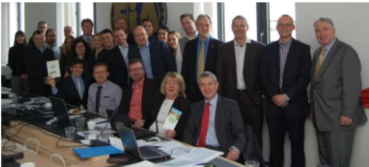
The project consortium and members of the ECOWILL Advisory Board