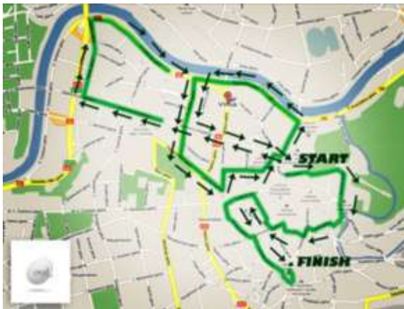
Vilnius CO 2 Green Drive route

In October 2010, the “ Vilnius CO 2 Green Drive ” event took place. This included a parade of the newest and most intriguing electric vehicles, which were equipped with colour coded GPS tracking devices, a huge virtual CO 2 sign was “painted” in Vilnius.