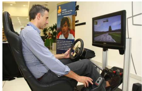
Cypriot World Rally Championship driver Spyros Pavlides testing the ecodriving simulator

This conference was organised by the EU commission and the Cypriot government in the context of the Cypriot presidency of the EU. The participation of ECOWILL highlighted the safety aspect of ecodriving. An ECOWILL driving simulator was provided for the conference.