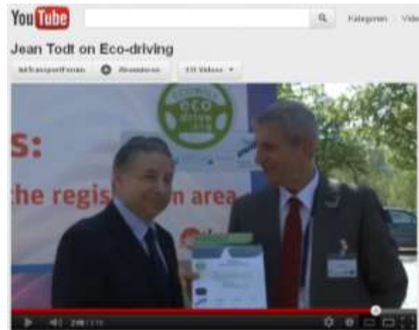
YouTube Video featuring Jean Todt receiving an ECOWILL certificate

At this event, some high-ranking ministry representatives from Germany as well as FIA president Jean Todt took part in ECOWILL training.