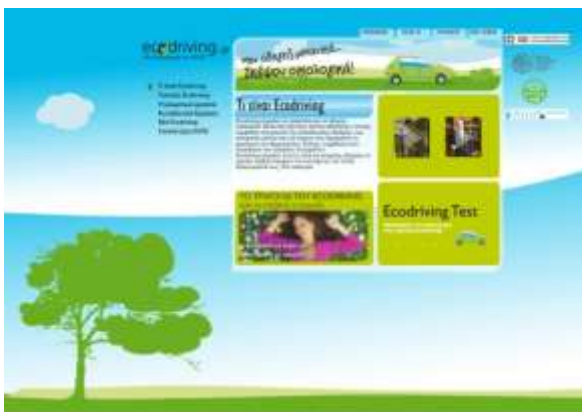
National ecodriving website

Since 2009, ecodriving techniques have been part of the theoretical part of novice drivers' examinations with 13 ecodriving questions. However, ecodriving training seminars in the practical level were, prior to the ECOWILL project, limited to pilot schemes mainly because of the lack of certified ecodriving trainers and funding. The ECOWILL project and the close collaboration with the PanHellenic Association of Driving Instructors significantly helped to further integrate ecodriving both for the theoretical and practical driving education in Greece.