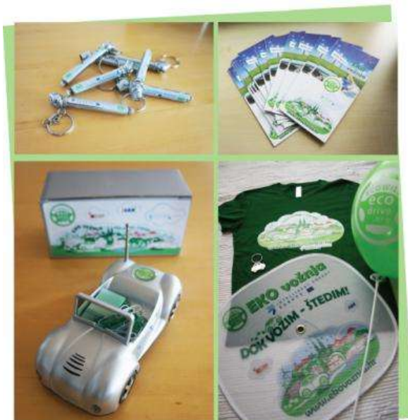
Marketing and promo materials....

Information and news about the ECOWILL project were disseminated through over 100 press releases (TV reports, radio, print, web site articles and Facebook pages), reaching over 4 million people. ECOWILL was mentioned in TV-news bulletins six times and in radio broadcasts twelve times. Due to these activities, more than 3 million radio listeners and over 3,5 million TV viewers have been reached.