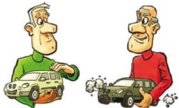
Mr. Skimpy and Mr. Splurge – the same initial situation, but a completely different view about smart driving (figures from the 'Smart Choices for Driving' brochure).

During ECOWILL it became very clear that instead of individual projects, the promotion of ecodriving is more effective on a continuous, on-going basis. In between some projects, there is very often an idling phase, which may slow down or even stop the promotion of activities owing to lack of funding. As a result of discussions between the Finnish Driving School Association and Motiva Oy, a co-operation plan has been worked out. This plan includes annual two-day Train-the-trainer seminars as well as the provision of regular information for trainers (e-mails, newsletters, etc.). This will help to keep ECOWILL achievements in use after the project. Moreover, marketing of ecodriving training has been integrated in the national Mobility Management programme.