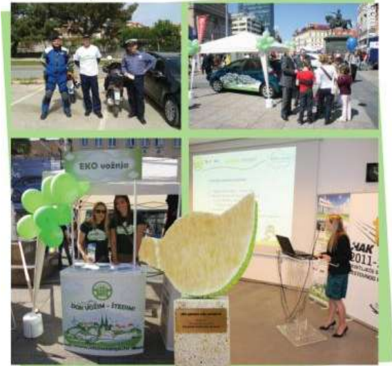
...and award for the best eco educational project

ECOWILL was presented at nine public events in four different cities. Four of them were organised on the main square in Zagreb. At these events, an ECOWILL stand provided high visibility for the project. The Croatian ECOWILL team answered a lot of questions from members of the public regarding ecodriving and disseminated a few thousand leaflets and other promotional materials.