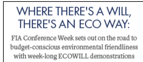
Snapshot from the 'FIA Conference Week 2012 Newsletter', 27.6.12

This conference attracted some 250 representatives from automobile clubs coming from more than 75 different nations. Beside a presentation on the ECOWILL project, short-duration training was offered to delegates.